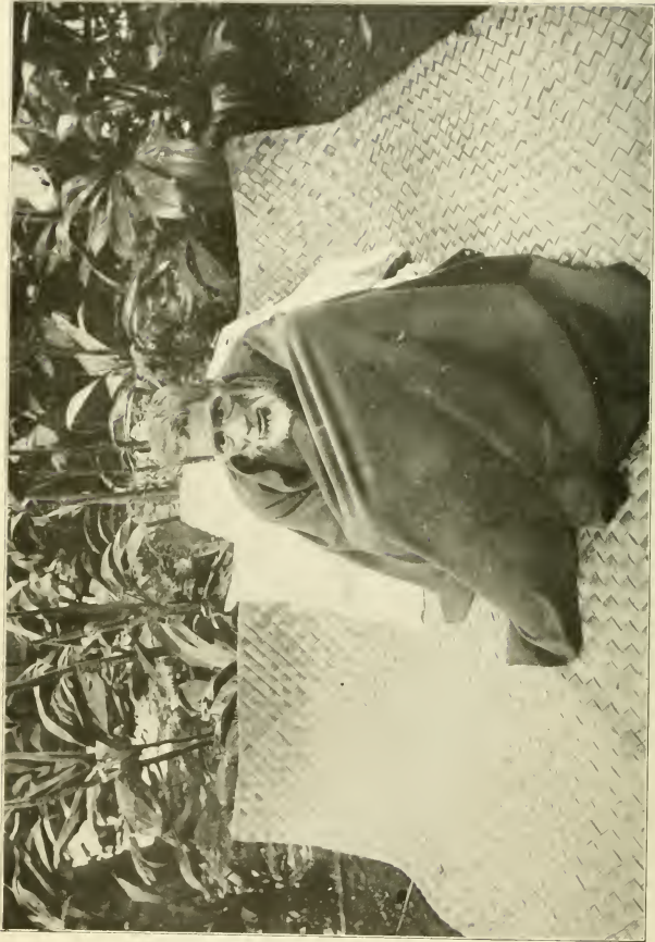
A KAHUNA OR NATIVE SORCERER